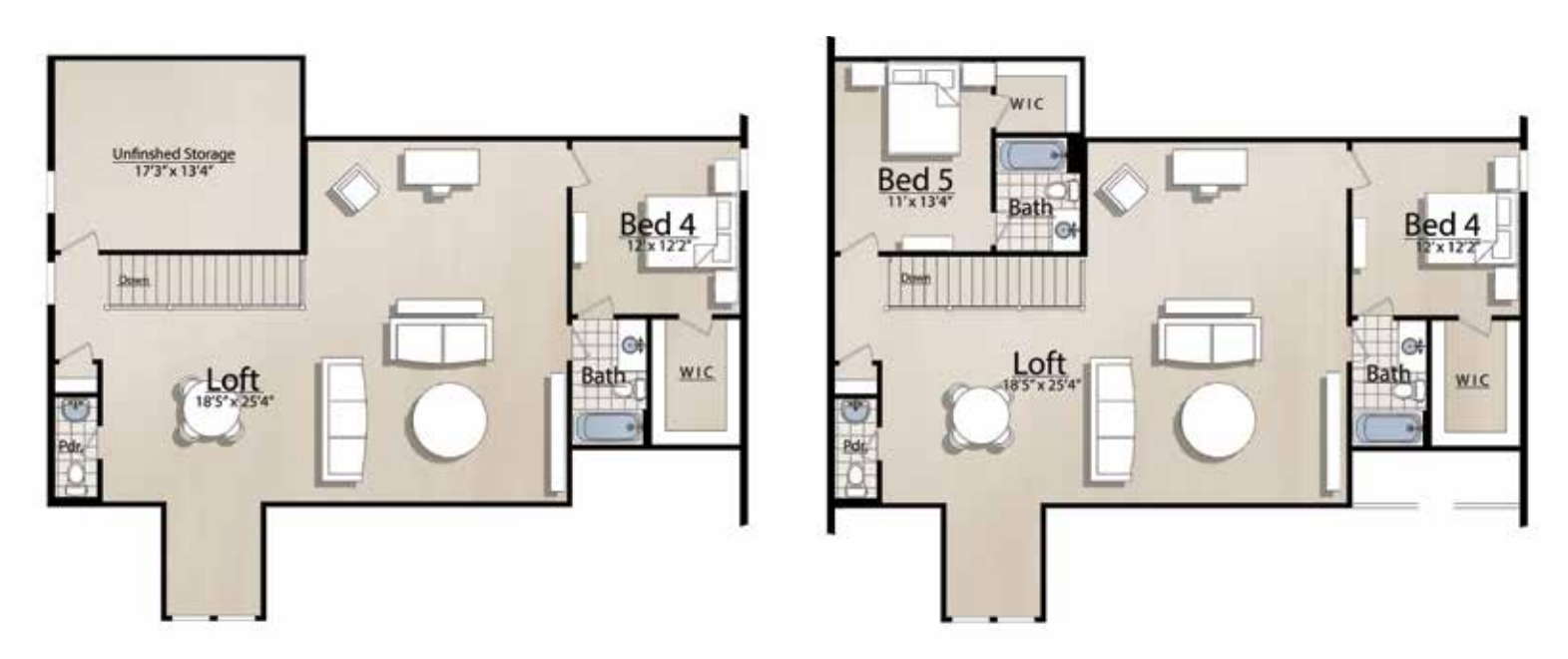
BONUS D - 1,118 SQ FT