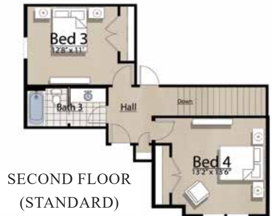
SECOND FLOOR (STANDARD)

4-5 BEDROOMS | 3.5 BATHS STUDY | BONUS 2,786 SQ FT 2 CAR GARAGE