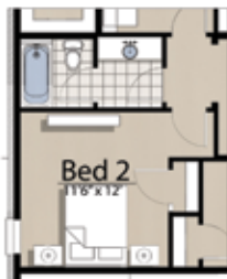
Hall Entry Bath