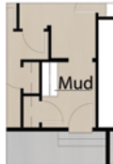
Mud Room w/ Drop Zone