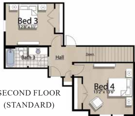
SECOND FLOOR (STANDARD)

4-5 BEDROOMS | 3.5 BATHS STUDY | BONUS 2,786 SQ FT 2 CAR GARAGE