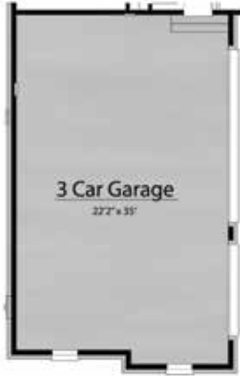
2 Door 3 Car Garage