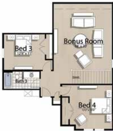
BONUS B - 949 SQ FT