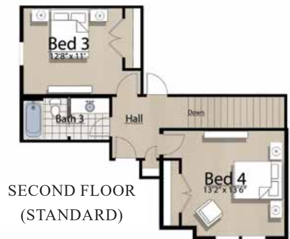
SECOND FLOOR (STANDARD)

RandyWiseHomes.com | 127 N Partin Drive | Niceville, FL 32578 | RG 0029913