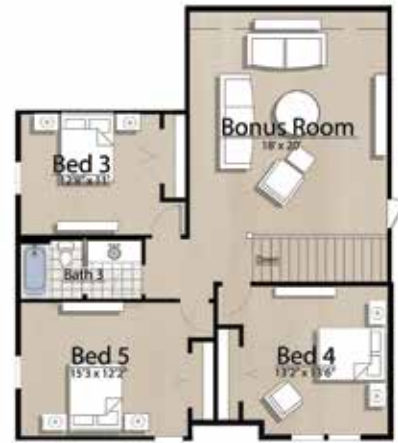
BONUS D - 1,149 SQ FT