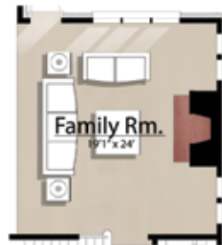
Fireplace w/ Windows