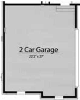
1 Door 2 Car Garage