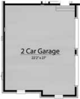
2 Door 2 Car Garage