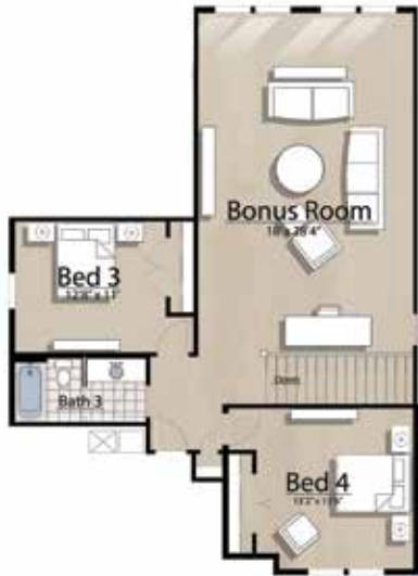
BONUS C - 1,102 SQ FT