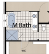
Master Walk in Shower w/ Free Standing Tub